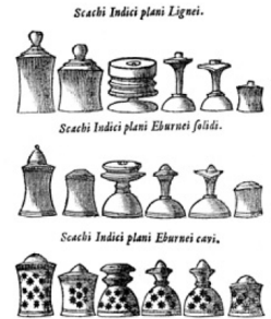
Fig. 1: Indian chess sets illustrated in De Ludis Orientalibus, Historia shahiludi ; Thomas Hyde, 1694, pages 134-135./ 8014

The three other sets, together with an exquisite chess board (described on p. 59-60) come from the city of Surat, the important harbour of the Mughal Empire north of Mumbai. Here, the EIC had installed their second factory in 1615, while the first factory existed since 1611 at Machilipatnam on the East Coast. In 1616 the Dutch established a factory there as well as the French, who were present from 1667 until 1759. Numerous goods of different type arrived at Surat from all over South-East Asia to be shipped abroad: diamonds, pearls, cotton, silk, musk, spices, indigo, medical plants and many more. Hyde received the games as a gift from Daniel Sheldon, whom Hyde refers to as a merchant (mercator) in the East Indies. Sheldon was member of the EIC since 1658, and factor at Balasore in West-Bengal.