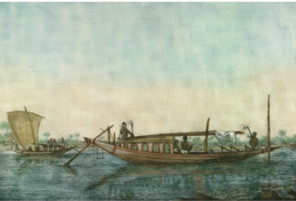
Fig. 8: Panawee ( panai ) boat. Colored etching by Frans Balthazar Solvyns. Reproduced from Solvyns 1808-12: III, pl. 5./ 8026.

al styles different from the John Company be identified as a panai (also spelled pan- pavilion or cabin used to transport cargo ing from the 19th century, the boats appear and animal heads at the stern and bow (fig.